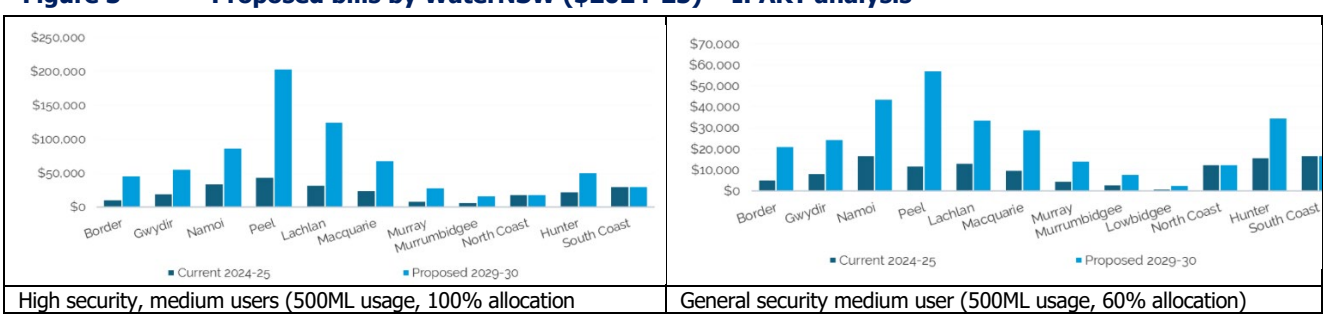
Figure 3 Proposed bills by WaterNSW ($2024-25) – IPART analysis

Additionally, these costs are on top of inflation . The productivity improvements in the farming sector will not offset these costs. They will be passed onto consumers where possible, lifting inflation, or for export industries will reduce international competitiveness.